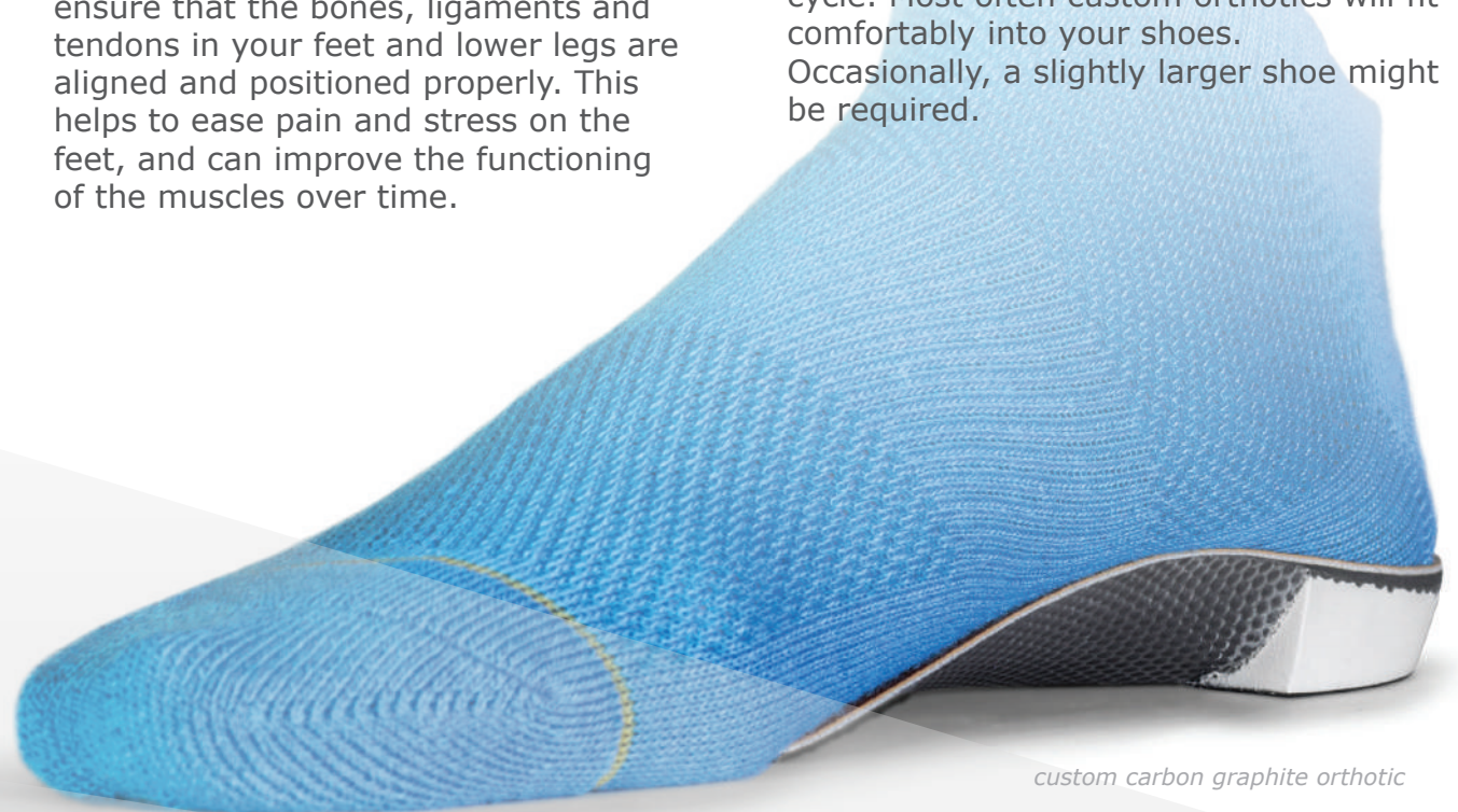
custom carbon graphite orthotic

Custom orthotics work on your feet much like glasses work on your eyes they reduce stress and strain on your body by bringing your feet back into proper alignment. The composite body of the custom orthotic helps to re-align the foot by redirecting and reducing certain motion that takes place during the gait cycle. Most often custom orthotics will fit comfortably into your shoes. Occasionally, a slightly larger shoe might be required.